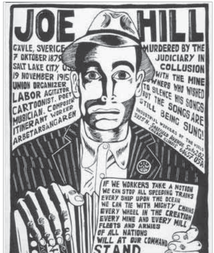
Detail of "Joe Hill," a 1979 poster by Carlos Cortez.

Missouri, as part of the Movement for Black Lives in 2014. The common theme is everyday people finding the courage to fight for social and economic justice.