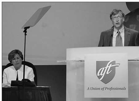
Bill Gates took the stage with AFT President Randi Weingarten at the union's last convention, earning an ovation from some delegates.

jointly setting up a system that promises widespread teacher failure.